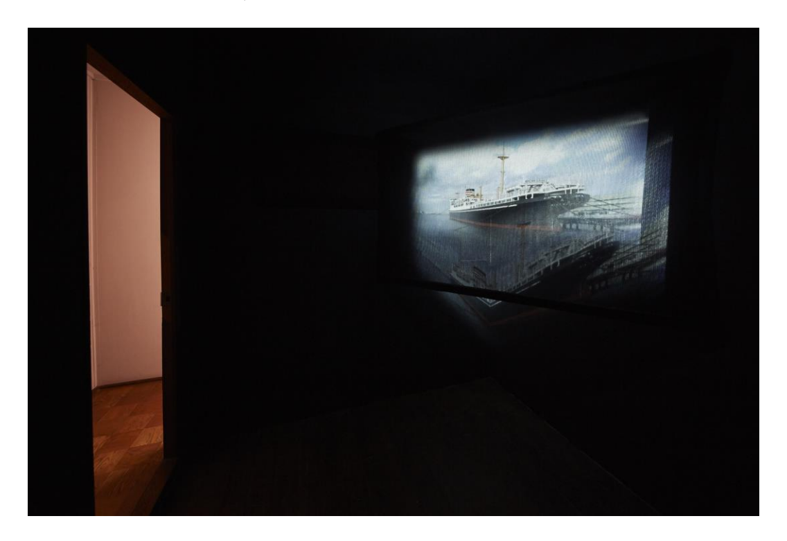
Figure 3. Port of Dream (2014), Cindy Mochizuki. Koganecho Art Bazaar, Fictive Communities Asia, 2014. Koganecho, Yokohama, Japan. Curated by Makiko Hara.

stuck to my skin, a haunting that is heavy. It is alive in this apartment. Like the dream of the ocean, it beckons me to listen.