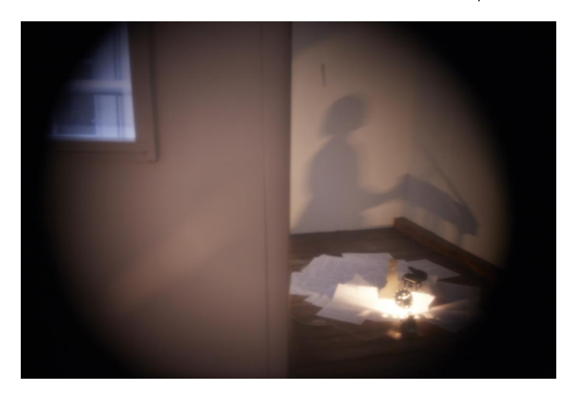
Figure 1. Port of Dream (2014), Cindy Mochizuki. Koganecho Art Bazaar, Fictive Communities Asia, 2014. Koganecho, Yokohama, Japan. Curated by Hakiko Hara.